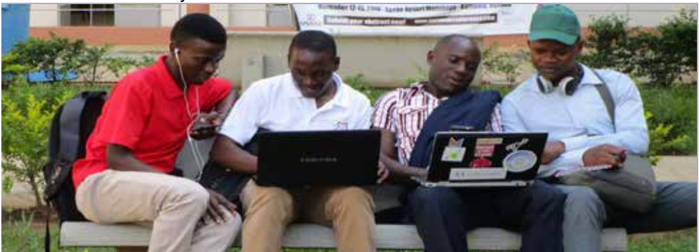
Learning experience: Students enjoy unlimited Wi-Fi connectivity.

The main campus boasts of a tranquil Campus environment , and facilities conducive for learning. Muni University uses Blended Learning approach, where face-to-face interaction is combined with online learning. Students enjoy unlimited Wi-Fi internet connectivity in and around campus, and use of Kindle Readers to access library e-resources. Teaching and learning is hands-on, with a lot of outreach activities to field labs and industry.